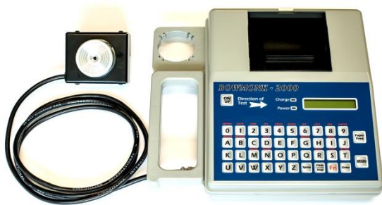
Bowmonk 2000 with Pedal Force Transducer