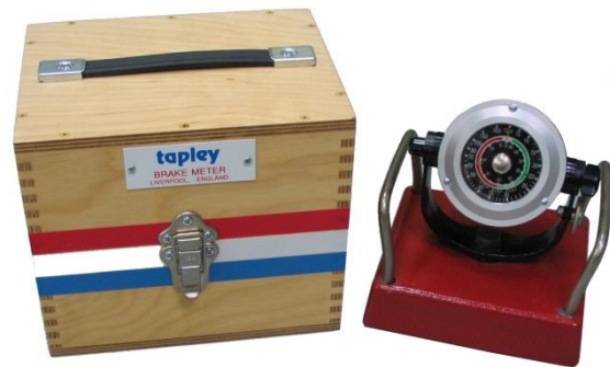
Wooden box supplied with Floor Block