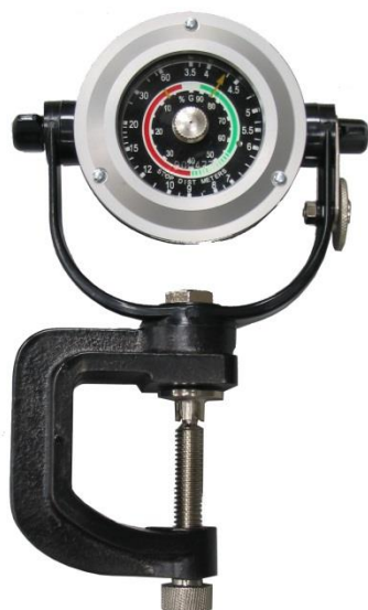
Tapley Meter with Clamp