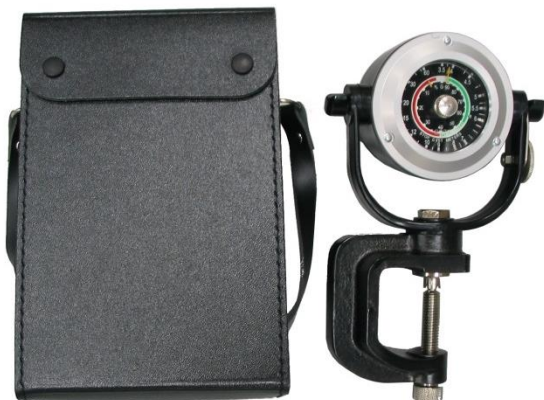
Carry case supplied with Clamp

This is the older Tapley meter, which is no longer in production but can still be repaired and calibrated.