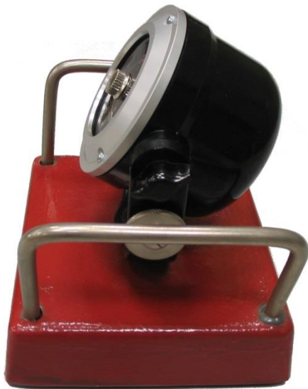
Tapley Meter with Floor Block