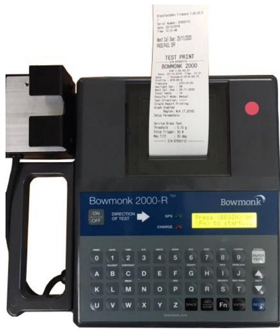
Bowmonk 2000-R (with optional Pedal Force Transducer)