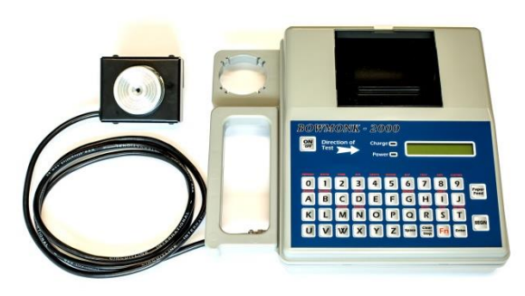
Bowmonk 2000 with Pedal Force Transducer