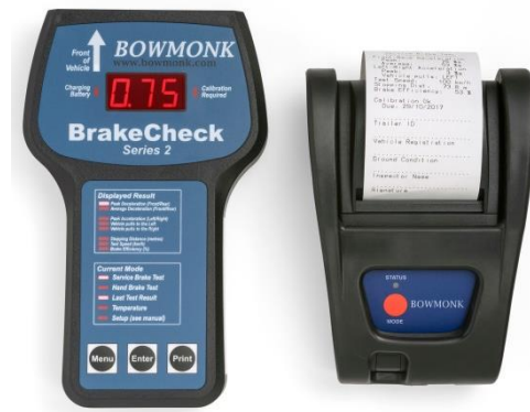
BrakeCheck with Optional Printer