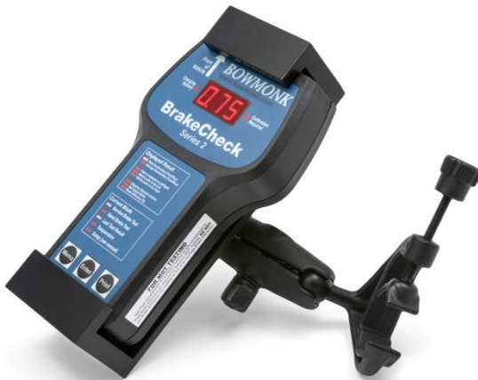
BrakeCheck with Motorcycle Bracket