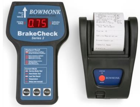
BrakeCheck with Optional Printer